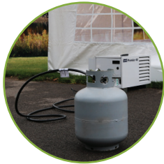
Runs on a single 20 lbs tank